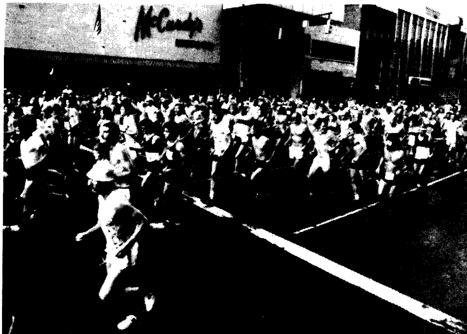
THE 1980 ROCHESTER MARATHON